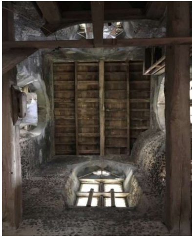
Tower at Hemsby, St Mary, pictured above.

Once grants have been awarded it is always pleasing to hear of the progress being made on repairs to those churches who have benefited.