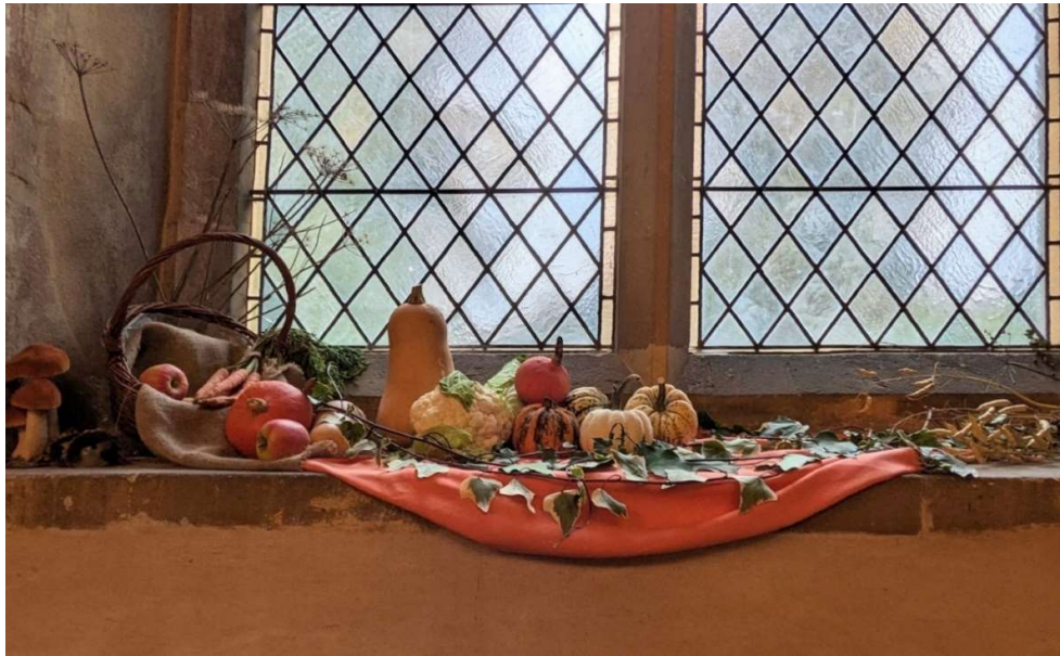
Harvest at Hingham,

A warm welcome to the final Norfolk Churches Trust Newsletter of 2023. As another year draws to a close here is a quick round up of what has been happening at the Trust over the last few months.