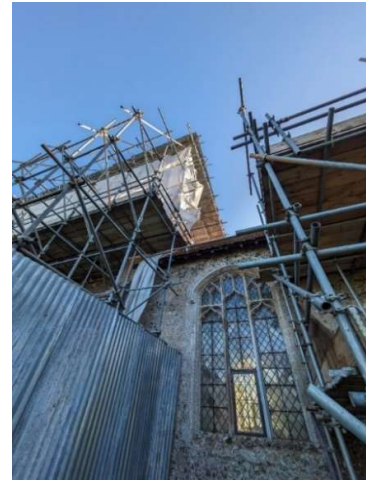
Scaffolding at Wilby, All Saints

Another church that has been fundraising for some time for major repair works on its chancel roof and ceiling, is Wilby, All Saints .