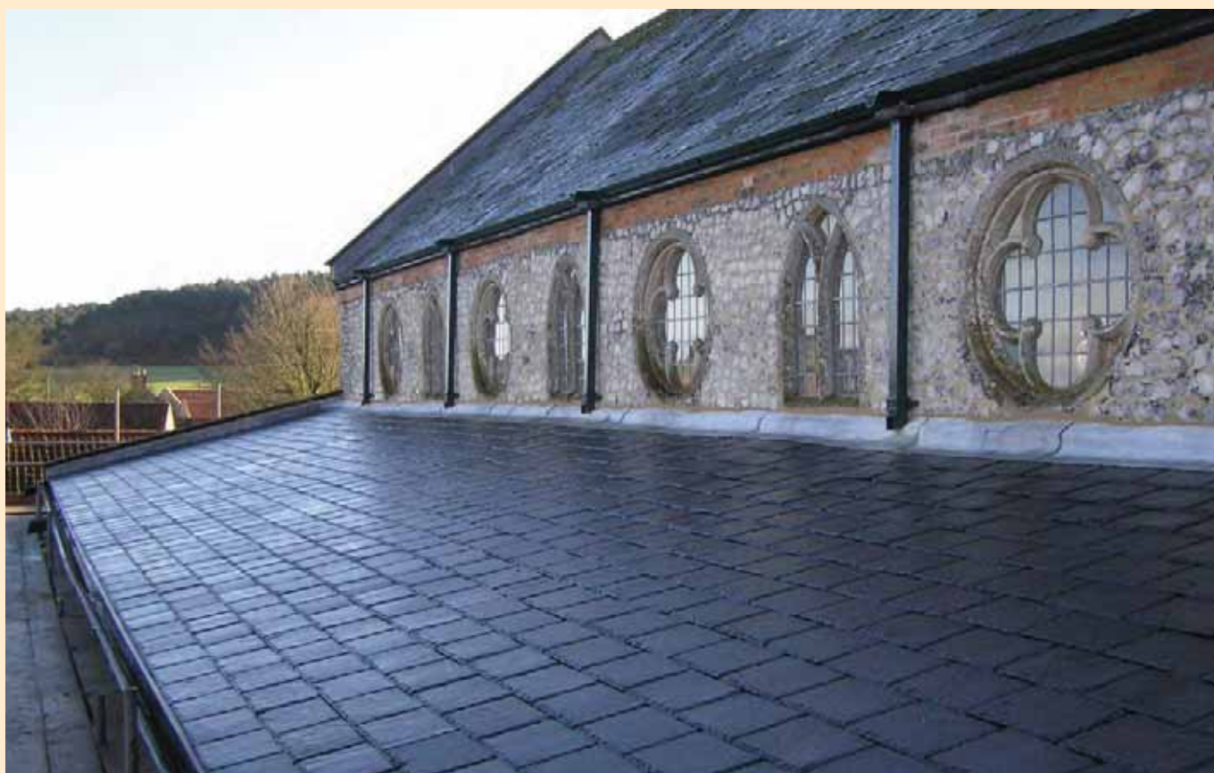
All Saints, Upper Sheringham: north aisle roof (photo: Nicholas Warns Architects).