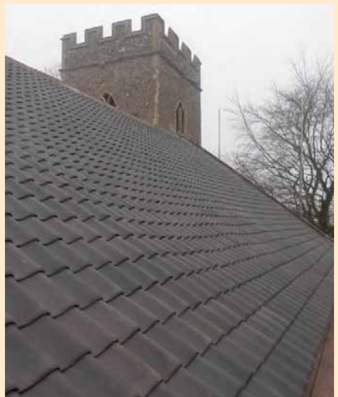
All Saints, East Tuddenham: north nave roof after re-tiling.

Today it is hard to imagine listed medieval rural churches being destroyed. It is thanks to the continuing work of the Trust and the determination of hundreds of unsung heroes in parishes across the county that Norfolk's churches remain central to their communities. Whilst many congregations may be shrinking, interest in church buildings in the wider community continues to grow. Visiting churches is frequently cited as a reason for days out rural England and these visitors provide an important economic boost to the rural community. The Trust's Church Tours are an enduring and valued part of the Trust's annual cycle of events, regularly attracting between fifty and seventy