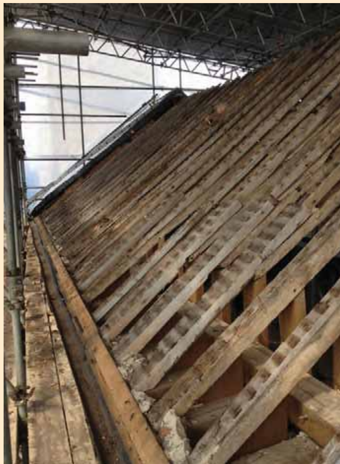
St Michael, Hockering: chancel roof.

The range of work funded by the Trust focuses on a wide range of repairs and conservation but in any year by far the majority of applications are for urgent roof repairs and overhauling rainwater goods and drainage. Of the twenty-seven grants paid out this year, twenty-two fell into these categories. However, this only tells part of the story because some of these applications also included repairs to masonry, windows, floors, ceiling repairs and conservation of wall paintings and medieval screens. To name a few: major projects completed during the year include complex repairs to the chancel