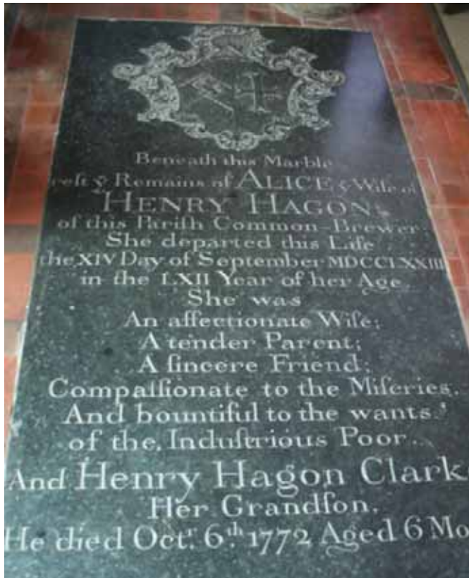
Saxthorpe. Hagon ledger, 1772.

applying two coats of pure beeswax polish. This will bring them up to as good as they day they were laid; from then on, a weekly dust with a dry mop will suffice.