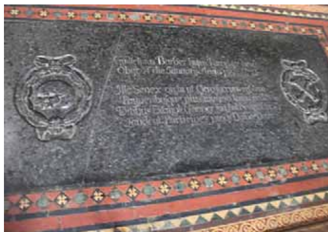
Reepham. Barber ledger, late 17C (photo: J Litten).

Ledgers are easy to clean, although it is advised not to wash them. All one needs do is to clear the inscriptions of dust – a medium to hard stencil brush is best for this task – and then run a vacuum over them before