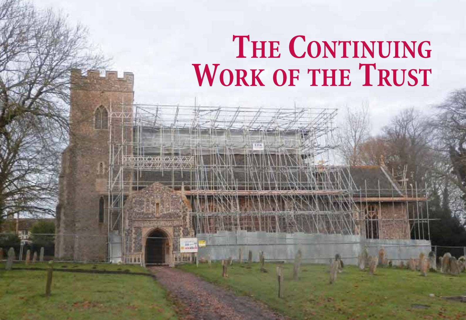
All Saints, East Tuddenham.